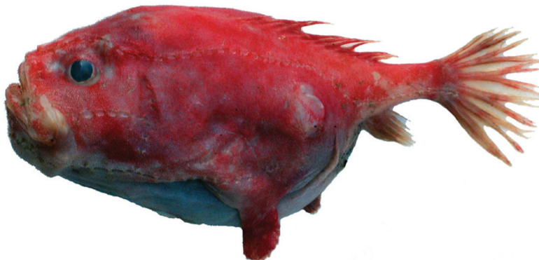
Chaunax brachysomus . From: Ho, H.-C., T. Kawai and F. Satria. 2015. Species of the angler-fish genus Chaunax from Indonesia, with descriptions of two new species (Lophiiformes: Chaunacidae). Raffles Bulletin of Zoology v. 63: 301-308.

a- , without; pous , foot, referring to pelvic fins “represented by minute rudiments”