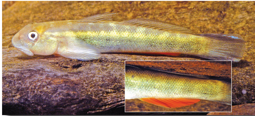
Sicyopterus erythropterus . From: Keith, P., G. R. Allen, C. Lord, and R. K. Hadiaty. 2012. Five new species of Sicyopterus (Gobioidei: Sicydiinae) from Papua New Guinea and Papua. Cybium v. 35 (no. 4) (for 2011): 299-318.