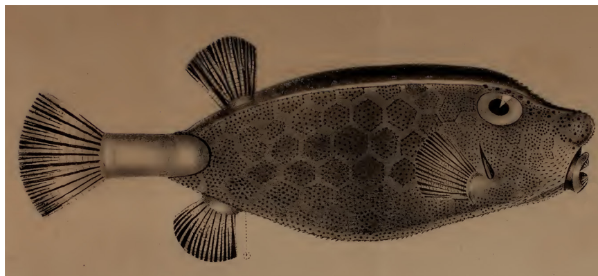
Ostracion rhinorhynchos . From: Bleeker, P. 1851. Bijdrage tot de kennis der Balistini en Ostraciones van den Indischen Archipel. Verhandelingen van het Bataviaasch Genootschap van Kunsten en Wetenschappenv. 24 (art. 11): 1-36 + 37-38, Pls. 1-7.

humpbacked, referring to strongly elevated dorsal ridge