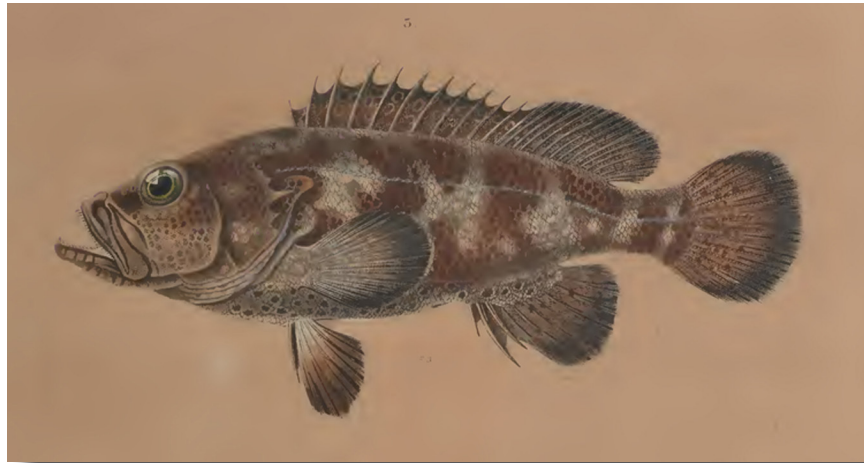
Epinephelus lebretonianus . From: Jacquinot, H. and A. Guichenot. 1853. Reptiles et poissons. In: Dumont d'Urville, J., Voyage au Pôle Sud et dans l'Océanie sur les corvettes "L'Astrolabe" et "La Zélée." v. 3 (pt 2): 1-56, Pls. 1-7.