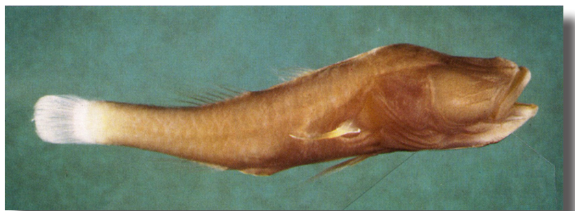
Caecogobius cryptophthalmus . From: Berti, R. and A. Ercolini. 1991. Caecogobius cryptophthalmus n. gen. n. sp. (Gobiidae Gobiinae), the first stygobitic fish from Philippines. Tropical Zoology v. 4 (no. 1): 129-138.