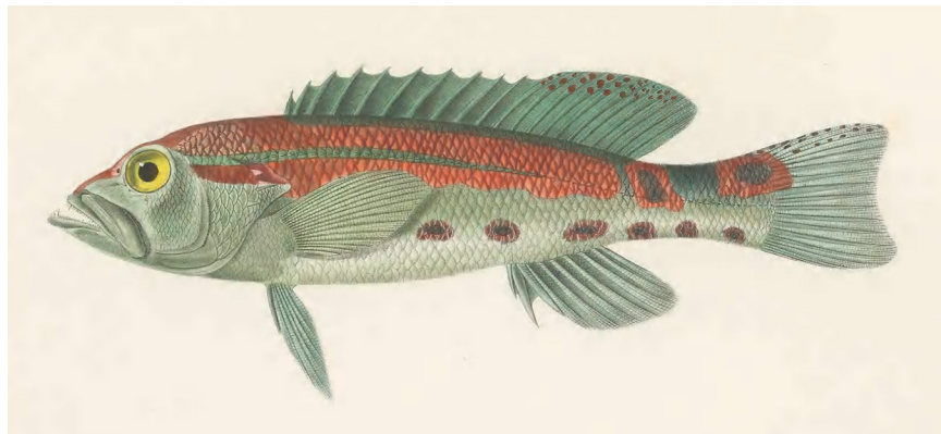
Serranus psittacinus . From: Valenciennes, A. 1846. Ichthyologie. 1 Table + Pls. 1-10. In: A. du Petit-Thouars. Atlas de Zoologie. Voyage autour du monde sur la frégate "Vénus," pendant les années 1836-1839 . Gide, Paris.

scribe, referring to bluish script-like marking on head (“capite scripto”)