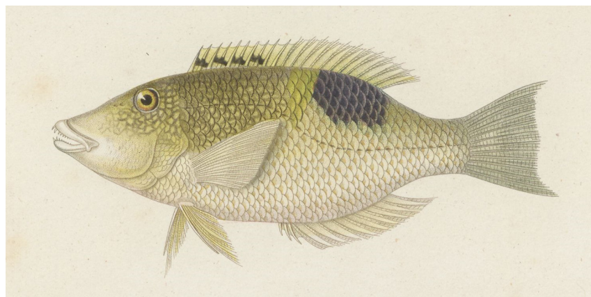
Bodianus perditio . From: Quoy, J. R. C. and J. P. Gaimard. 1834. Voyage de découvertes de "l'Astrolabe," exécuté par ordre du Roi, pendant les années 1826–29, sous le commandement de M. J. Dumont d'Urville . Paris. Description in v. 3, pt. 2 (“Poissons”). Plate in v. 1 (“Atlas Zoologie”).