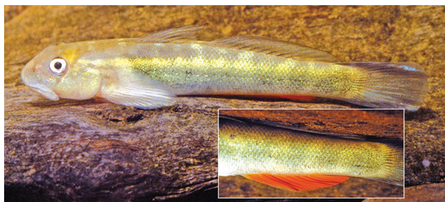
Sicyopterus erythropterus . From: Keith, P., G. R. Allen, C. Lord, and R. K. Hadiaty. 2012. Five new species of Sicyopterus (Gobioidei: Sicydiinae) from Papua New Guinea and Papua. Cybium v. 35 (no. 4) (for 2011): 299-318.