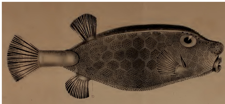
Ostracion rhinorhynchus . From: Bleeker, P. 1851. Bijdrage tot de kennis der Balistini en Ostraciones van den Indischen Archipel. Verhandelingen van het Bataviaasch Genootschap van Kunsten en Wetenschappen . 24 (art. 11): 1-36 + 37-38, Pls. 1-7.

para- , near, i.e., close to Acanthostracion but distinguished by the shape of its carapace and the “disposition” of its spines