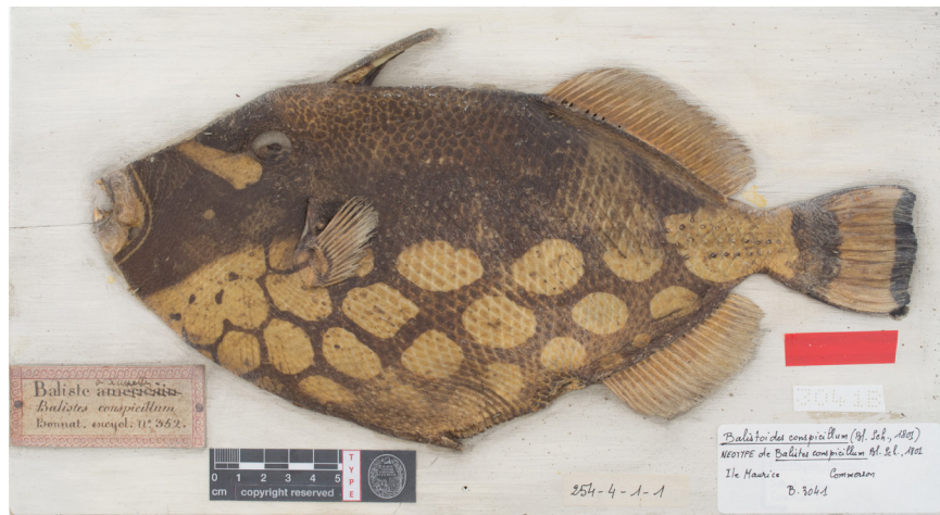
Balistoides conspicillum , holotype.