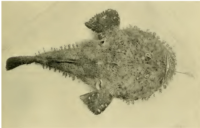
Lophius gastrophysus . From: Miranda Ribeiro, A. 1913-15. Fauna brasiliense. Peixes. Tomo V. P bysoclísti . Arquivos do Museu Nacional de Rio de Janeiro v. 17: [1-679] or 755 pp. with title pages, 31 pls., 3 tabs.

pertaining to an angler, referring to first spine of dorsal fin modified into an angling apparatus (illicium) that bears a bulb-like or fleshy “bait” ( esca ) to attract fish prey to its cavernous mouth