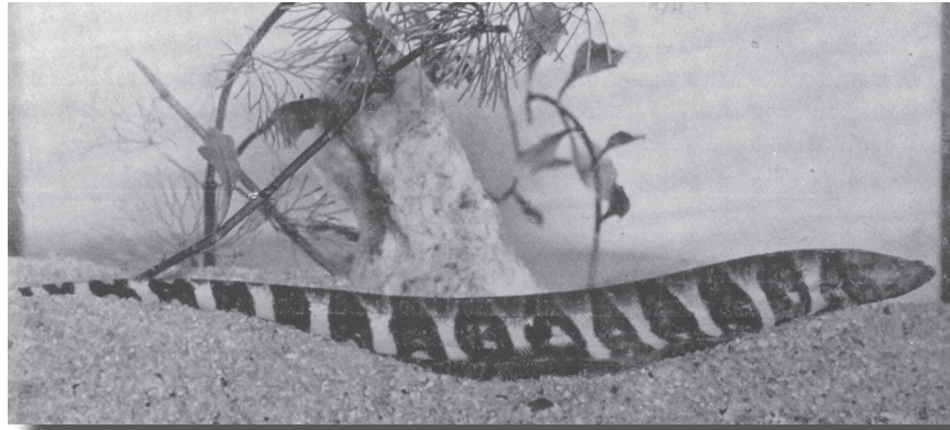
Gymnotus coatesi . From: La Monte, F. R. 1935. Two new species of Gymnotus . American Museum Novitates No. 781: 1-3.