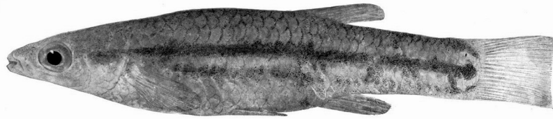
Jenynsia eigenmanni . From: Haseman, J. D. 1911. Some new species of fishes from the Rio Iguassú. Annals of the Carnegie Museum v. 7 (nos. 3-4) (19): 374-387, Pls. 48, 50, 73-83.