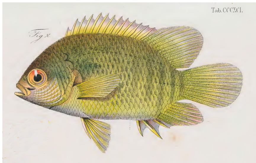
First published illustration of Pristolepis grootii . From Bleeker, P. 1876-77. Atlas ichthyologique des Indes Orientales Néerlandaises, publié sous les auspices du Gouvernement colonial néerlandais. Tome VIII. Percoides II, (Spariformes), Bogodoides, Cirrhitéoides . Frédéric Muller & Co, Amsterdam. v. 8: 1-156, Pls. 321-354, 361-362.

rubra , red; pinnis , fin, referring to orange-red soft dorsal, soft anal and caudal fins, and yellow-to-orange pelvic fins