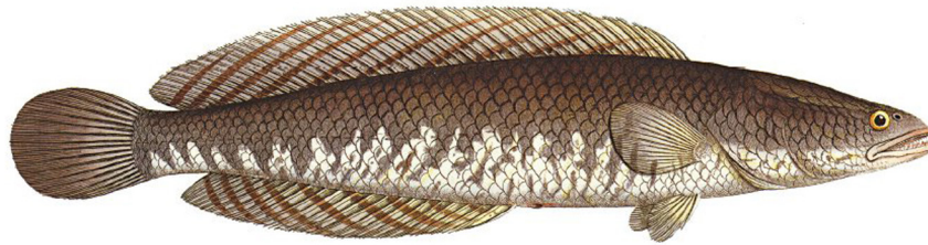
Channa striata . From: Bloch, M. E. 1793. Naturgeschichte der ausländischen Fische. Berlin. v. 7: i-xiv + 1-144, Pls. 325-360.