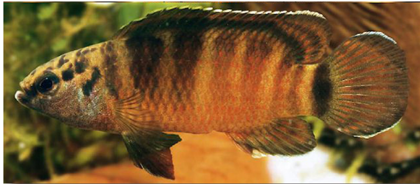
Badis juergenschmidti , male. From: Schindler, I. and H. Linke. 2010. Badis juergenschmidti — a new species of the Indo-Burmese fish family Badidae (Teleostei: Perciformes) from Myanmar. Vertebrate Zoology v. 60 (no. 3): 209-216.