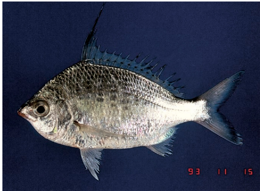
Gerres microphthalmus . From: Iwatsuki, Y., S. Kimura and T. Yoshino. 2002. A new species: Gerres microphthalmus (Perciformes: Gerreidae) from Japan with notes on limited distribution, included in the “ G. filamentosus complex.” Ichthyological Research v. 49 (no. 2): 133-139.

oyena , Arabic name for this species along the Red Sea (widely occurs in Indo-West Pacific from Africa to Australia)