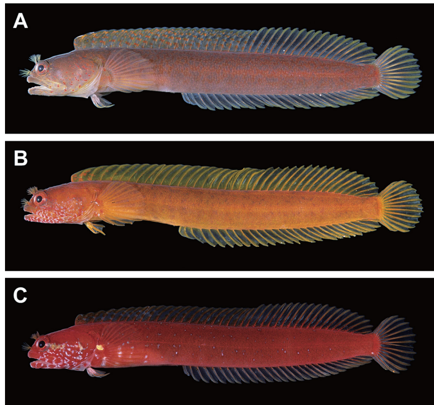
Neoclinus monogrammus , A (male), B and C (female). From: Murase, A., M. Aizawa and T. Sunobe. 2010. Two new chaenopsid fishes, Neoclinus monogrammus and Neoclinus nudiceps (Teleostei: Perciformes: Blennioidei), from Japan. Species Diversity v. 15 (no. 2): 57-70.

bare or naked, referring to its lack of scales