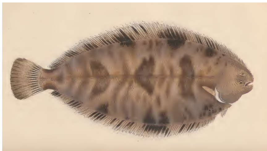
Microchirus variegatus . From: Donovan, E. 1808. The natural history of British fishes, including scientific and general descriptions of the most interesting species, and an extensive selection of accurately finished coloured plates . Vol. 5. London: F. C. and J. Rivington. 407-516 unnumbered pp., plates 97-120.

variegated, i.e., of different colors, presumably referring to eyed side of body, “pale, clouded or marbled with fuscous,” forming “as it were a series of interrupted bands”