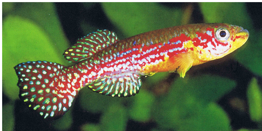
Fundulopanchax gresensi . From: Berkenkamp, H. O. 2003. Über den Artenkreis Fundulopanchax mirabilis (Radda, 1970), mit der Beschreibung von Fundulopanchax gresensi sp. nov. Aquaristik aktuell . v. 11: 50-56.

para- , near, proposed as a subgenus of Aphyosemion by Kottelat (1976), but name not made available until Radda 1977