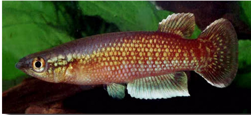
Pachypanchax patriciae , red morph male. From: Loiséle, P. V. 2006. A review of the Malagasy Pachypanchax (Teleostei: Cyprinodontiformes, Aplocheilidae), with descriptions of four new species. Zootaxa No. 1366: 1-44.