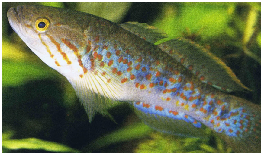
Mogurnda pulchra . From: Horsthemke, H. and W. Staeck. 1990. Eine neue Schläfergrundel aus Papua-Neuguinea Mogurnda pulchra n. sp. (Pisces: Eleotrididae). Die Aquarien- und Terrarienzeitschrift (DATZ) v. 43 (no. 3): 160-164.