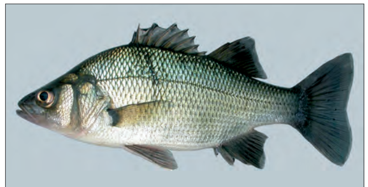
White Perch ( Morone americana) from the Cape Fear River, North Carolina.