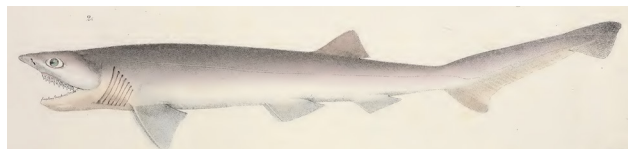
Possibly first-published image of Hepranchias perlo (then identified as Notidanus cinereus ). From: Bonaparte, C. L. 1841. Iconografia della fauna italica per le quattro classi degli animali vertebrati. Tomo III. Pesci. Roma. Fasc. 30, puntata 155–160, 5 pls.

Hepranchias perlo (Bonnaterre 1788) from the French vernacular “Le Perlon,” pearl, probably referring to its smooth and grayish (“lisse & grisâtre”) skin