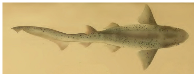
Possibly first-published image of Notorynchus cepedianus (then identified as Hexanchus indicus ). From: Müller, J. and F. G. J. Henle. 1838–41. Systematische Beschreibung der Plagiostomen. Veit und Comp., Berlin. i–xxii + 1–200, 60 pls. [Pp. 1–28 published in 1838, reset pp. 27–28, 29–102 in 1839, i–xxii + 103–200 in 1841.]

Notorynchus cepedianus (Péron 1807) -[ lanus (L.) belonging to: Bernard Germain Étienne de La Ville-sur-Ilлон, comte de [count of] La Cépède (also spelled as La Cépède, Lacépède and Lacepède, 1756–1825), author of Histoire Naturelle des Poissons (1798–1803) and Péron’s “illustrious master” (translation) in ichthyology