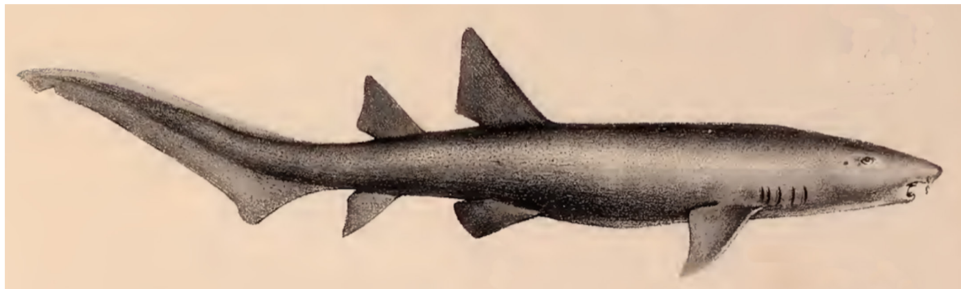
Nebrius concolor (= ferrugineus ), type species of Nebrius . From: Rüppell, W. P. E. S. 1835–38. Neue Wirbelthiere zu der Fauna von Abyssinien gehörig. Fische des Rothen Meeres. Sigmund Schmerber, Frankfurt am Main. i-ii + 1–148, Pls. 1–33. [Pp. 53–80 and Pls. 15–21 published in 1837.]