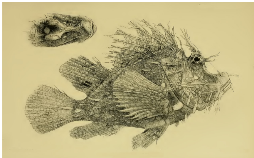
Rhinopias frondosa . From: Günther, A. 1892. Description of a remarkable fish from Mauritius, belonging to the genus Scorpaena . Proceedings of the Zoological Society of London 1891 (pt 4): 482-483, Pl. 39.