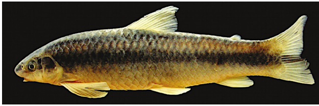
Parodon magdalenensis , holotype, 108.6 mm SL. From: Londoño-Burbano, A., C. Román-Valencia and D. C. Taphorn. 2011. Taxonomic review of Colombian Parodon (Characiformes: Parodontidae), with description of three new species. Neotropical Ichthyology 9 (4): 709–730.

Parodon atratoensis Londoño-Burbano, Román-Valencia & Taphorn 2011 -ensis, Latin suffix denoting place: Río Atrato, northwest Colombia, type locality