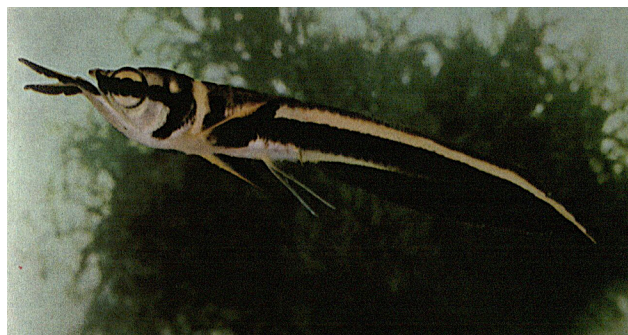
Osteoglossum ferreirai , juvenile. From: Kanazawa, R. H. 1966. The fishes of the genus Osteoglossum with a description of a new species from the Rio Negro. Ichthyologica, The Aquarium Journal 37 (4): 161–172.

sclero- , from sklēros (Gr. σκληρός), tough or hard; pages , from págios (Gr. πᾶγιος), firm or solid, i.e., presumably referring to bodies of all osteoglossids known at the time, which Günther later (1868) described as “covered with large hard scales, composed of pieces like mosaic” 1