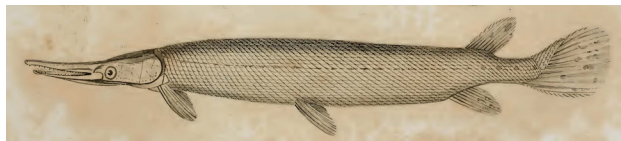
Possibly first-published image of Lepisosteus platostomus . From: Kirtland, J. P. 1842. Descriptions of fishes of the Ohio River and its tributaries. Boston Journal of Natural History 4 (1) (art. 3): 16–26, Pls. 1–3.

Lepisosteus platyrhincus DeKay 1842 flat- or broad-snouted, from platýs (Gr. πλατύς), flat or broad, and rhýnchos (Gr. ῥύγχος), snout, referring to its broad and flattened upper jaw