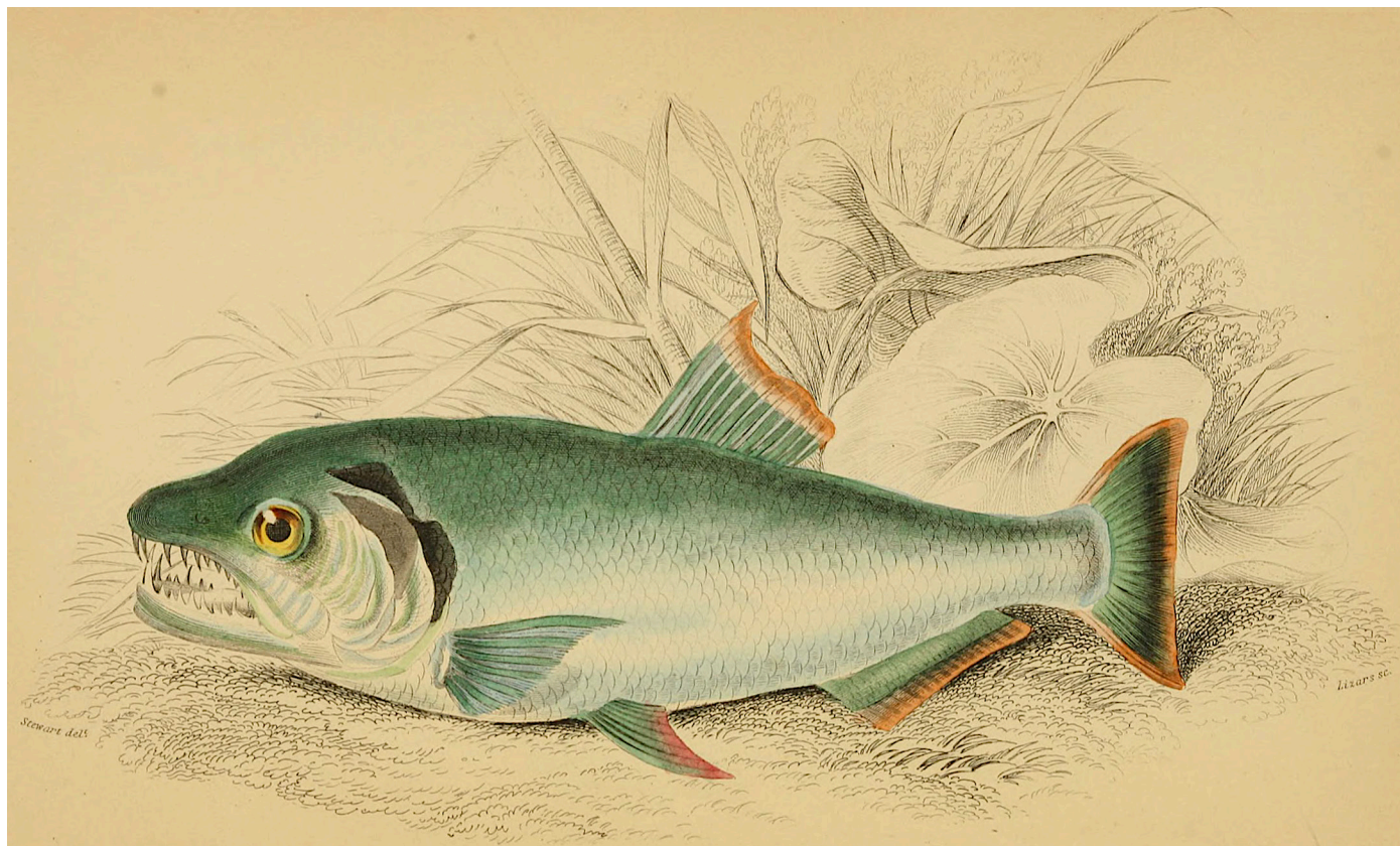
Hydrolycus armatus . From: Schomburgk, R. H. 1841. The Natural history of fishes of Guiana. Part I. In: W. Jardine (ed.) The Naturalists' Library. Vol. 3. W. H. Lizars, Edinburgh. 17–263, Pls. 1–30. [Schomburgk wrote the Introduction; Jardine wrote the descriptions from Schomburgk's notes and drawings.]