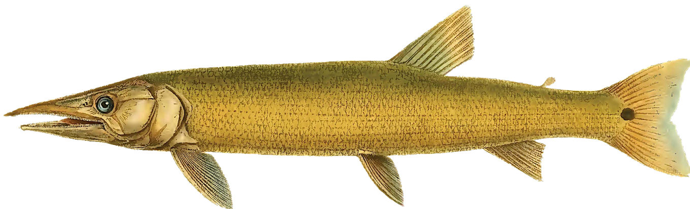
Boulengerella cuvieri . From: Spix, J. B. von and L. Agassiz 1829-31. Selecta genera et species piscium quos in itinere per Brasiliam annis MDCCCXXVII-MDCCCXXX jussu et auspiciis Maximiliani Josephi I. Monachii (Munich). Part 1: i-xvi + i-ii + 1-6 + 1-82, Pls. 1-48, Part 2: 83-138, Pls. 49-101. [Part 1 published June 1829, part 2 Jan. 1831.]