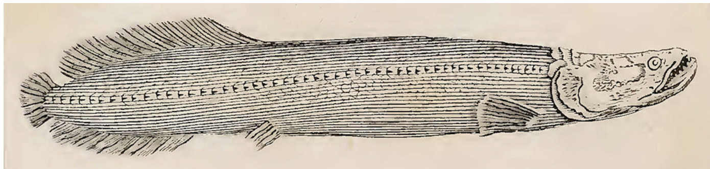
"Vastres géant," illustration upon which description of Arapaima gigas was based. From: Cuvier, G. 1816 (but published with 1817 as the date). Le Règne Animal distribué d'après son organisation pour servir de base à l'histoire naturelle des animaux et d'introduction à l'anatomie comparée. Les reptiles, les poissons, les mollusques et les annélides. Edition 1. v. 4: i–viii + 1–255, Pl. 1–15.